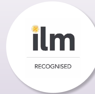
ILM recognised programme

'Absolutely fantastic – already recommended to three colleagues'