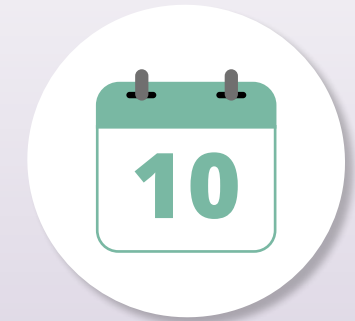
A 10-day programme