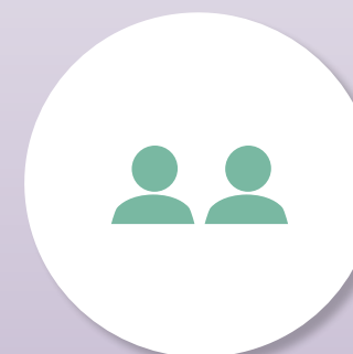
2 individual coaching sessions