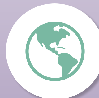
UK or global delivery