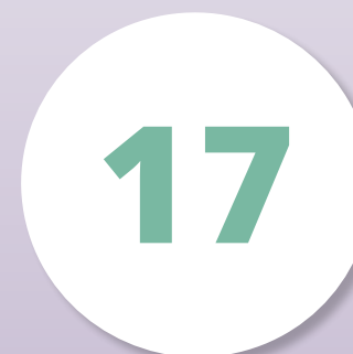
17 subject areas