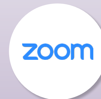
Virtual or F2F delivery