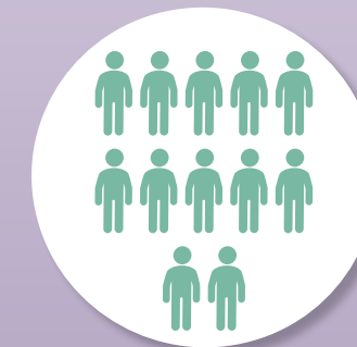
10-12 usual group size