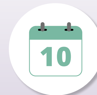
A 10-day programme